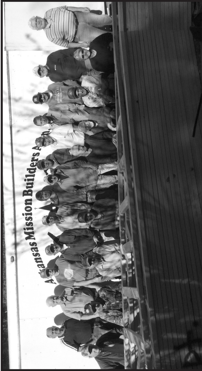
Mission Builders ,